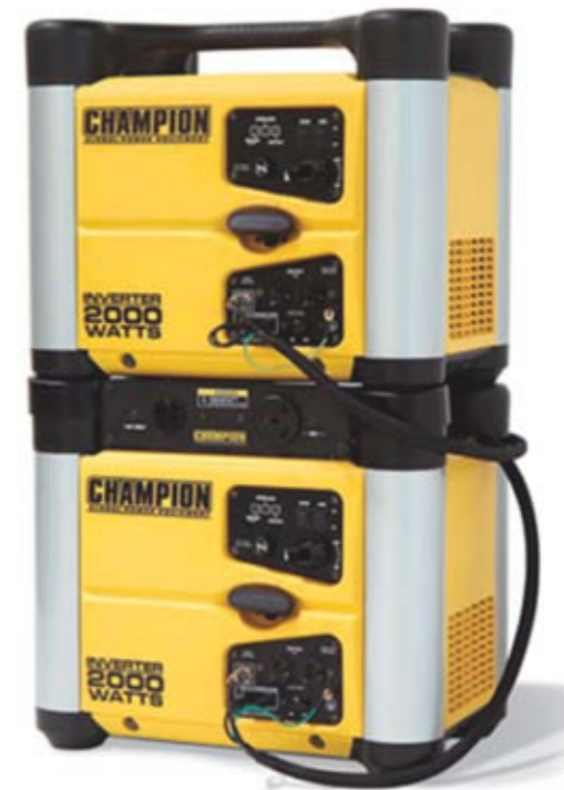
Innovative Design for Stacking