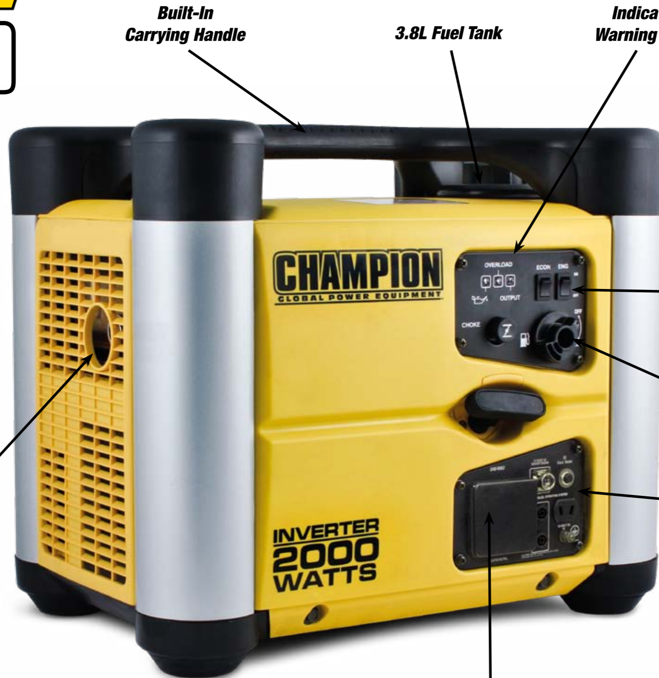
Built-In Carrying Handle