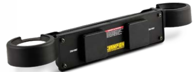
Parallel Kit Required for Parallel Operation (Second inverter and parallel kit are sold separately)